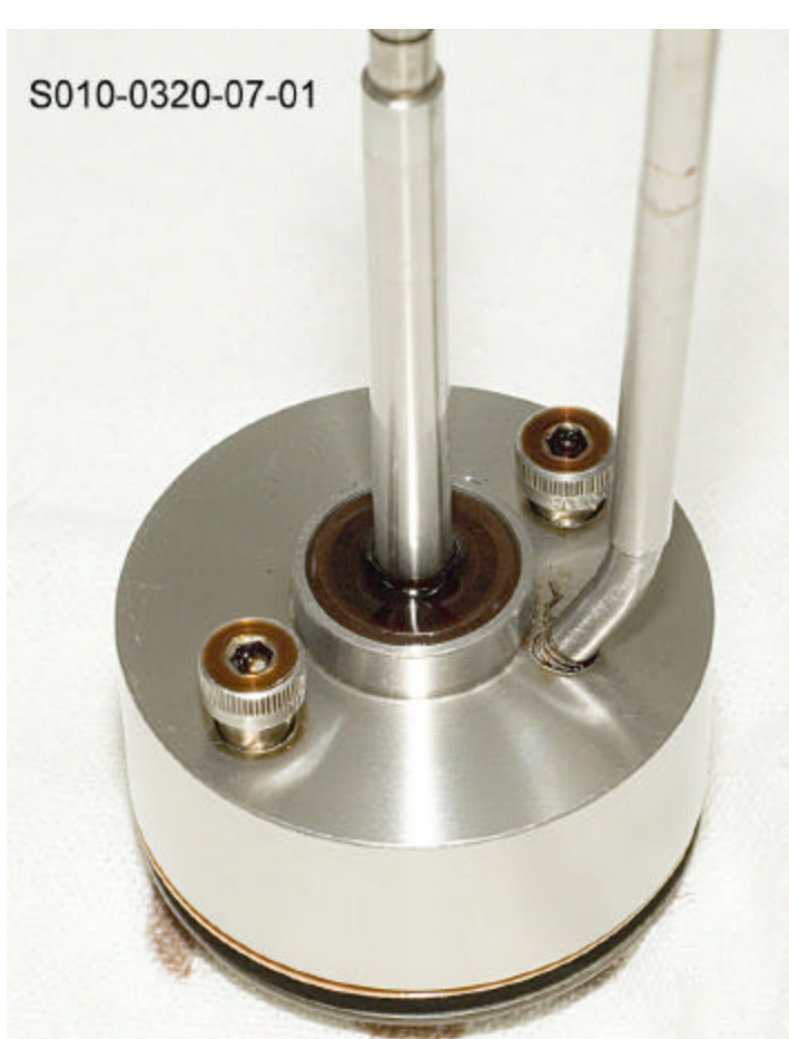
AMSOIL Synthetic ATF left no deposits following 1,106 hours of extended ABOT testing.