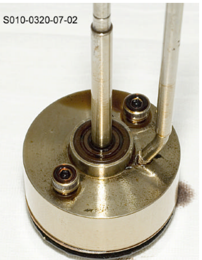
Texaco Havoline ATF left a covering of deposits following 1,012 hours of extended ABOT testing.